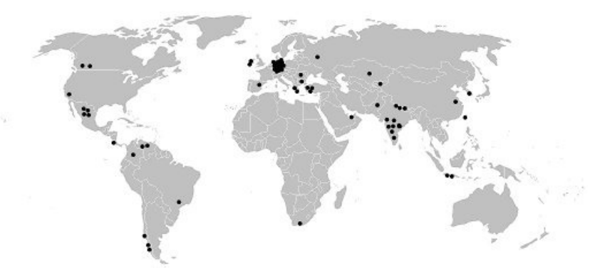
Fig. 01: World map with REM students' countries of origin

When REM was launched in October 2008, 26 students started their studies as the first generation of REM. In the following year, REM attracted more than 150 students of which 38 were accepted. These 64 REM students from the first and second generation come from 27 different countries. The following map provides an overview of the students' countries of origin with each black dot representing one student.